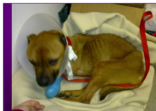
Before SAA intervention